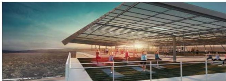
Rooftop yoga studio