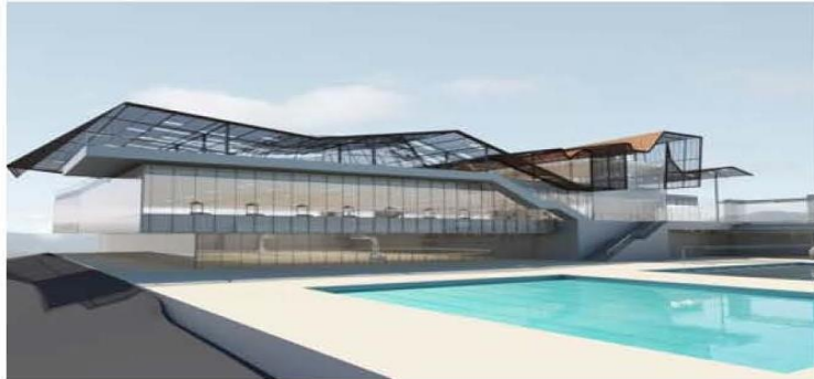
Building exterior and swimming pools