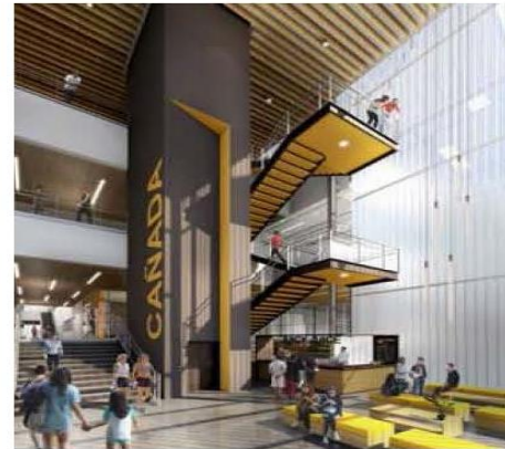
Interior lobby entrance