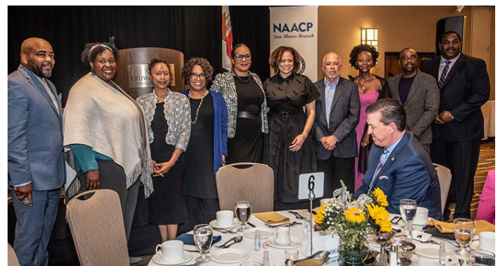
African American Leaders in San Mateo County being recognized at the Gala.