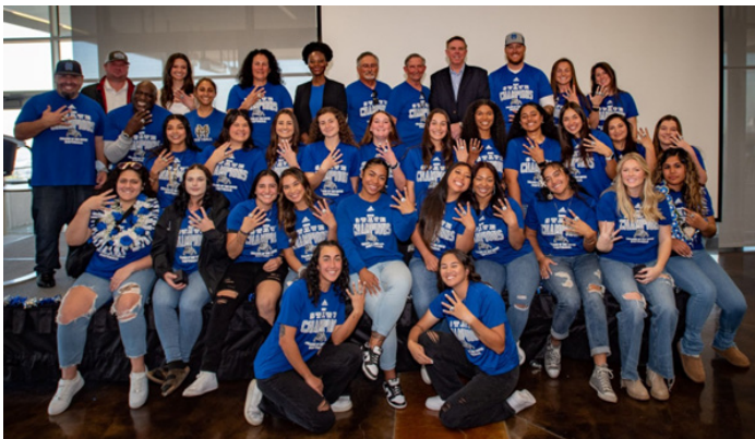
Softball team showing off their championship rings at their ring ceremony.