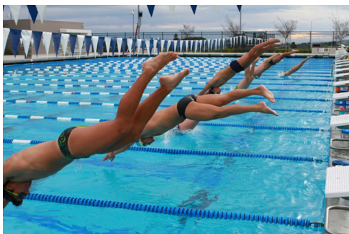
The 2016 men's swim team practicing.