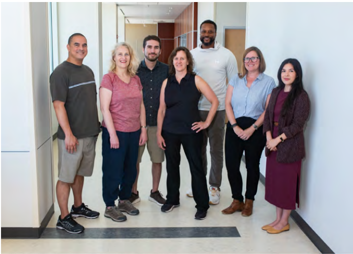
CSM welcomed new faculty hires at New Faculty Orientation.