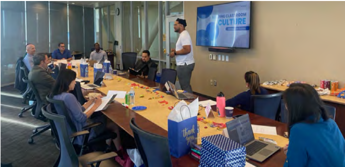
Strategies for Successful Teaching in Dual Enrollment workshop.

Participating faculty and staff are excited for the new academic year ahead and are determined and committed to building excellent in-classroom experiences and creating greater opportunities and connection to CSM for all dual enrollment students. Additionally, on Thursday, August 10, 2023, the CSM Dual Enrollment team, in partnership with San Mateo Union High School District, co-hosted our inaugural "Dual Enrollment Launch" event, bringing in CSM faculty, high school partner teachers and site administrators, and high school district partners, to kick off the new academic year together. The day was truly inspiring as attendees engaged in networking, aligning our efforts with a clear purpose, developing curriculum and programming with a focus on equity, exchanging best practices, and reinforcing our shared dedication to excellence. The CSM campus is actively working towards fostering a sense of community and exploring strategic approaches to enhance our partnerships, all centered around serving the needs of our students. We are so appreciative of the support provided by SMCCCD, CSM, and our high school partners (SMUHSD and CUSD), and are committed to continuing to grow the CSM Dual Enrollment Program and creating dynamic and memorable experiences for students.