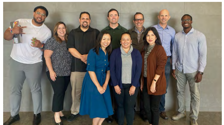
The CSM Dual Enrollment team with Dual Enrollment faculty.

On Tuesday, August 1, and Wednesday, August 2, the CSM Dual Enrollment team were thrilled to host a 2-day summer experience, "Strategies for Successful Teaching in Dual Enrollment" for our dedicated new and returning CSM Faculty who will be teaching dual enrollment courses in the new academic year.