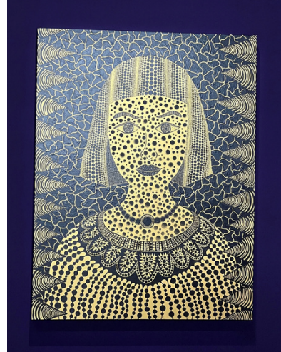
2015 Self Portrait

Death of Nerves. The last installation of this artwork was in 1976 and was on a much smaller scale. This new one was commissioned for this exhibition and spans 3 floors of the museum. (Note only a portion of the installation is shown in this photo.) This work "communicates an important message of hope and rebirth central to Kusama's practice."