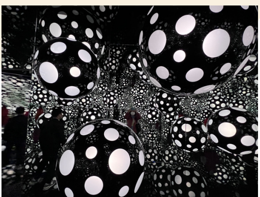
Dots Obsession - Aspiring to Heaven's Love. Yayoi Kusama's concept of infinity and accumulation is expressed in this immersive mirrored room.