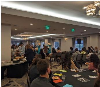
WRHC Vietnamese Dance Performance, Italian Buffet, and Bingo!