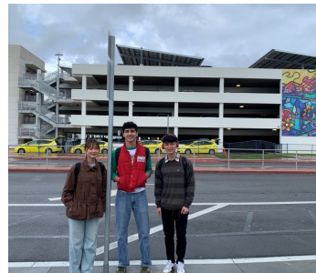
Long Beach Airport. From left to right: