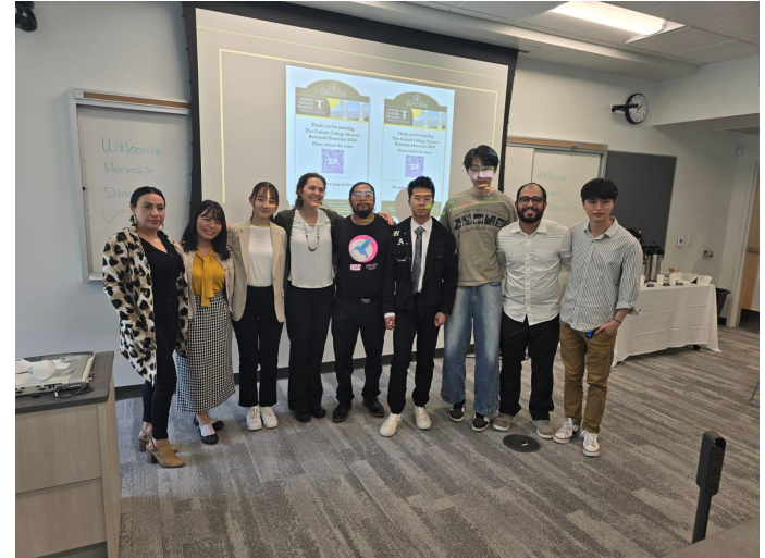
Honors Research Showcase 2024